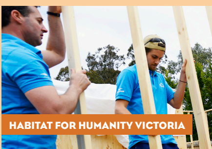
HABITAT FOR HUMANITY VICTORIA

Despite growing demand, the stock of public and community housing continues to decline as a proportion of all housing in Victoria. Public and community housing accounts for three per cent of all dwellings, down from four per cent in 2006.