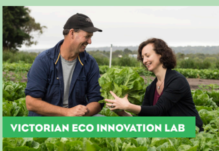
VICTORIAN ECO INNOVATION LAB

The introduction of water restrictions in response to water shortages and drought has been largely supported by Melbourne's residents. Water use has dropped 22 per cent from ten years ago.