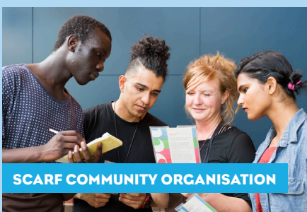
SCARF COMMUNITY ORGANISATION

It is estimated that two-thirds of children entering primary school today will work in jobs that do not yet exist. Key skills for the future job market include problem-solving, critical and creative thinking, and STEM skills.